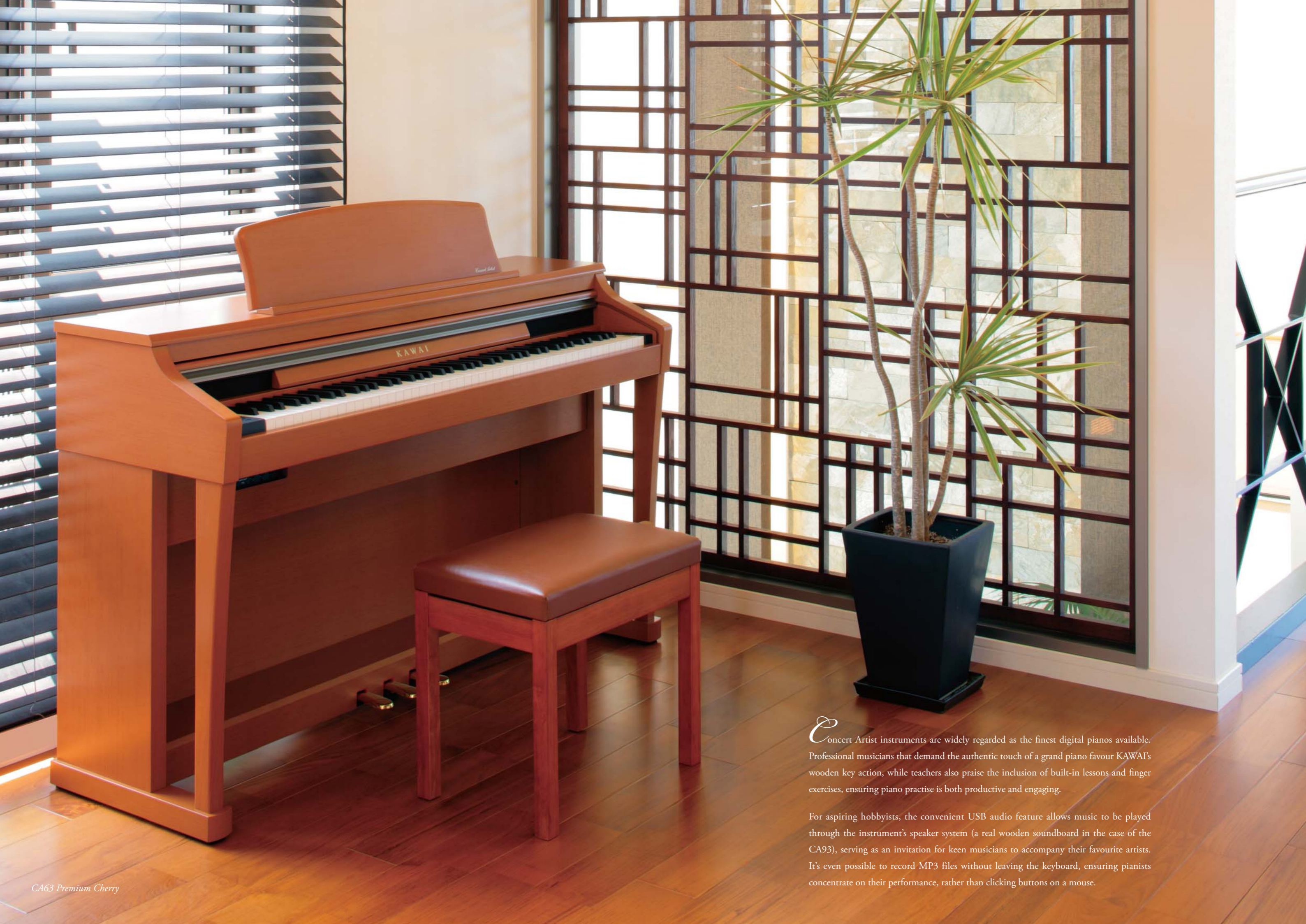
CA63 Premium Cherry

Concert Artist instruments are widely regarded as the finest digital pianos available. Professional musicians that demand the authentic touch of a grand piano favour KAWAI's wooden key action, while teachers also praise the inclusion of built-in lessons and finger exercises, ensuring piano practise is both productive and engaging.